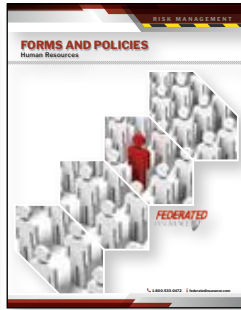
HR Forms and Policies