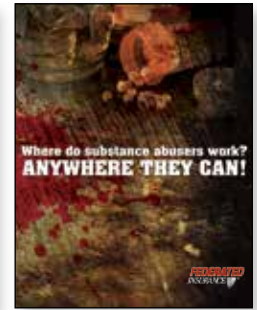
Drug- and Alcohol-Free Workplace Program

Yes! I would like to receive complimentary risk management materials from Federated Insurance.