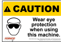
Eye Protection Sign