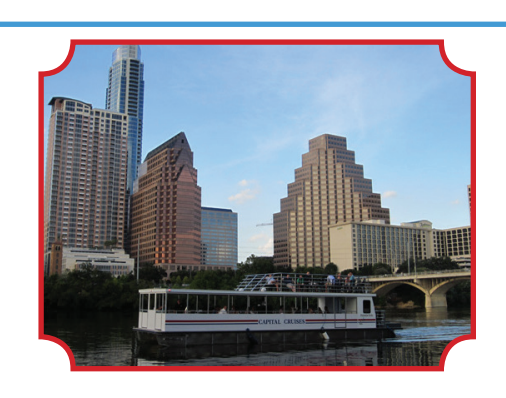
Spouse / Guest Session Friday, 11:00am

Come and enjoy a relaxing 2-hour boat cruise along Lady Bird Lake with exceptional views of downtown Austin from the water. This fun event will allow you to mix and mingle with spouses and guests – renew or create new friendships! The Capital Cruise boat departs and returns to the dock just outside the Hyatt Austin Regency Hotel.