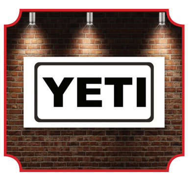
YETI™ Happy Hour Reception Friday, 5:00pm Sponsored by: