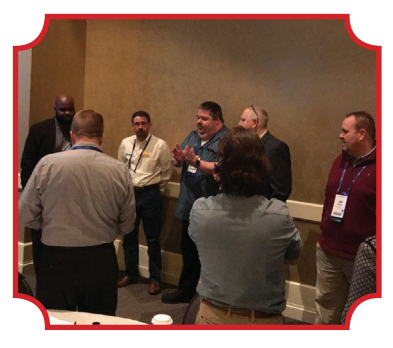
First Timers Reception Thursday, 5:00pm