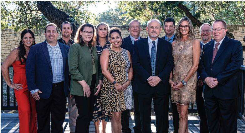
PMPA Board of Directors

One of the biggest advantages of being a PMPA member is networking. The connections you make at PMPA events can turn into friendships that last a lifetime. Annual Meeting