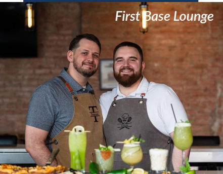
First Base Lounge

Located less than a block from the Glass City Center, First Base Lounge serves up Detroit-style pizza and elevated cocktails in a relaxed atmosphere.