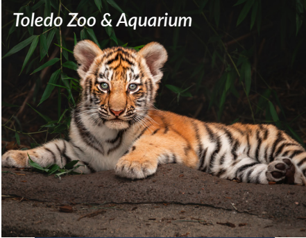
Toledo Zoo & Aquarium

Enjoy over 16,000 animals representing 680 species! Explore the ProMedica Museum of Natural History and touch small sharks and stingrays at the state-of-the-art Aquarium in addition to all of the zoo's exotic animal exhibits.