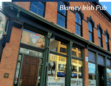
Blarney Irish Pub

Elevated pub fare, a cozy welcoming atmosphere, live music, and Sunday's favorite brunch buffet have made Manhattan's a downtown staple for years.