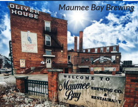
Maumee Bay Brewing

Registry's chef-driven menu focuses on seasonal flavors and local ingredients.