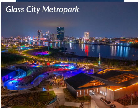
Glass City Metropark

Toledo's newest Metropark, Glass City features The Ribbon, a multipurpose skating rink, playgrounds, on-site dining, and scenic views of Toledo's downtown.