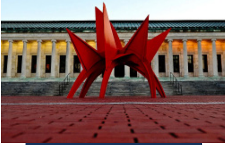
Toledo Museum of Art