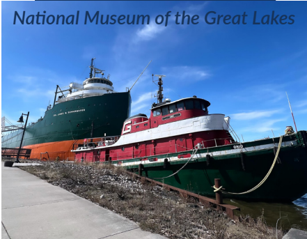
National Museum of the Great Lakes

Discover breathtaking photographs, incredible artifacts, interactive exhibits, a 617-foot iron ore freighter, plus a historic tug tell the awe-inspiring stories of the Great Lakes.